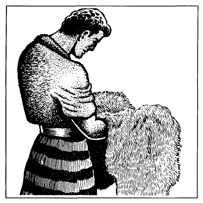
Gideon holds the fleece that proved God had chosen him to lead Israel against the Midianites.

But Gideon wanted another sign. "I will lay the fleece out again tonight,"