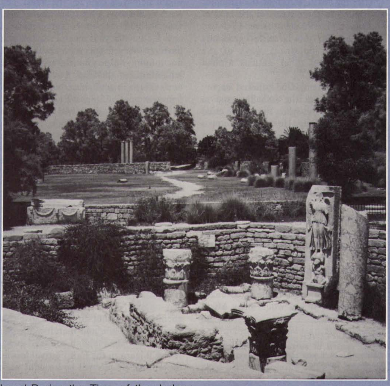
Israel During the Time of the Judges