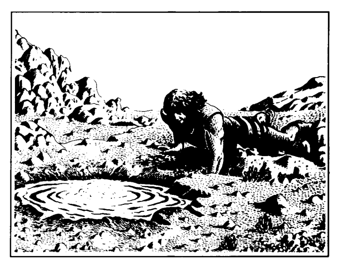
God caused a spring of cool, clear water to bubble up, thus saving Samson's life.

But Samson outfoxed them by leaving the inn at midnight. When he reached the main gates of the city, he discovered they were locked and barred.