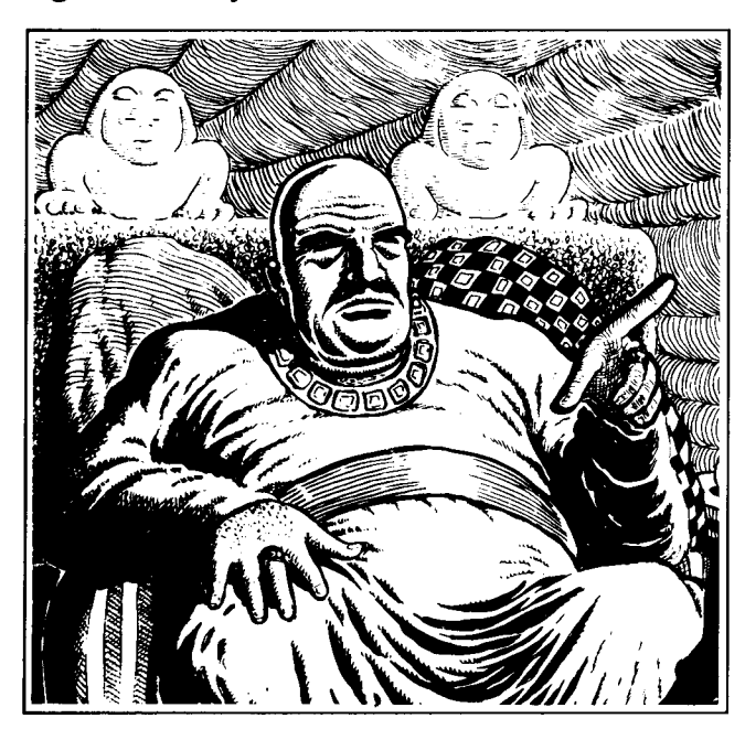
King Eglon demanded that Ehud tell him the secret message.

Ehud quietly left the room, locking the door behind him. By the time Eglon's body was discovered, Ehud had